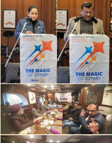
Glimpse of PETS & SETS